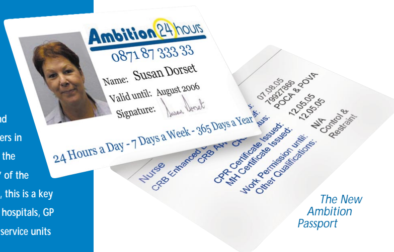
The New Ambition Passport

UK press have recently highlighted the major concerns of schools in validating the child protection compliance of supply teachers - and Ambition 24hours' new 'passport' for its teaching personnel is already proving to be a unique asset for education service providers in 2006.